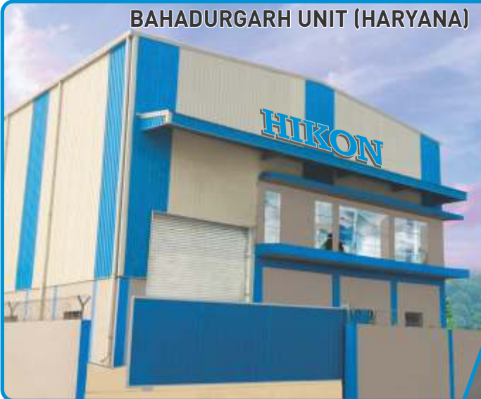
BAHADURGARH UNIT (HARYANA)