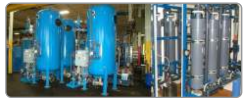
WASTE WATER TREATMENT PLANT FOR WATER RECYCLE