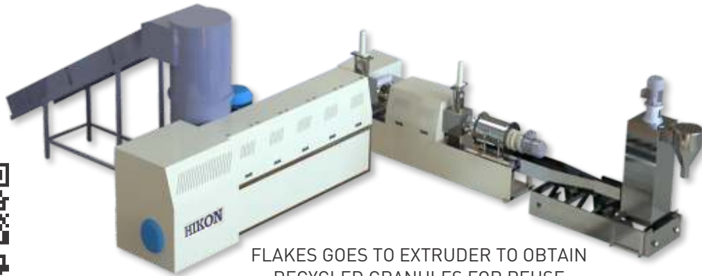
FLAKES GOES TO EXTRUDER TO OBTAIN RECYCLED GRANULES FOR REUSE