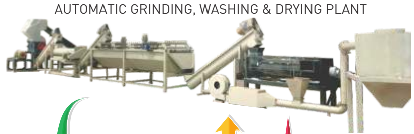
AUTOMATIC GRINDING, WASHING & DRYING PLANT