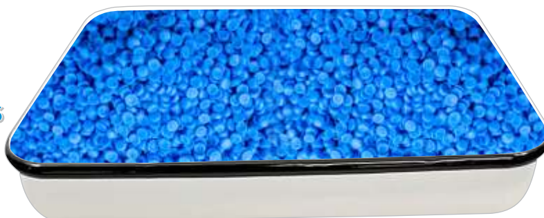
RECYCLED GRANULES FOR REUSE

200 COMPLETE RECYCLING PROJECTS DELIVERED